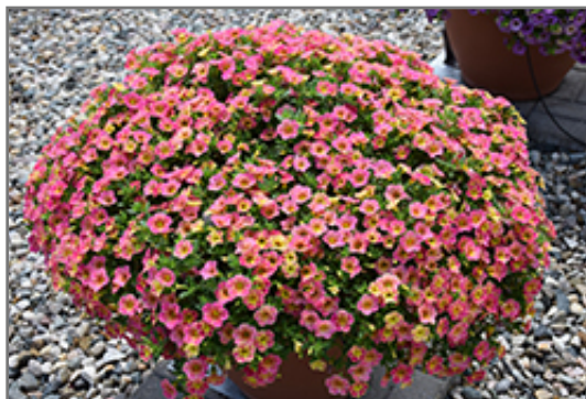
Chameleon Sunshine Berry Calibrachoa in bloom

Chameleon Sunshine Berry Calibrachoa is a fine choice for the garden, but it is also a good selection for planting in outdoor containers and hanging baskets. Because of its trailing habit of growth, it is ideally suited for use as a 'spiller' in the 'spiller-thriller-filler' container combination; plant it near the edges where it can spill gracefully over the pot. Note that when growing plants in outdoor containers and baskets, they may require more frequent waterings than they would in the yard or garden.