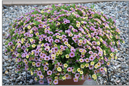
Chameleon Blueberry Scone Calibrachoa in bloom