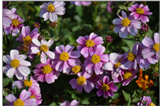
Pretty in Pink Bidens flowers