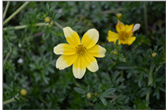
Cupcake Banana Cream Bidens flowers