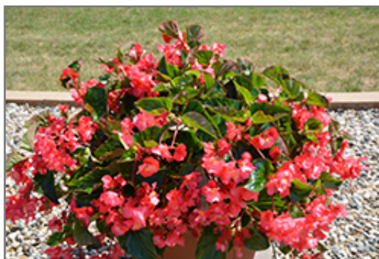
Megawatt Rose Green Leaf Begonia in bloom

Megawatt Rose Green Leaf Begonia is a fine choice for the garden, but it is also a good selection for planting in outdoor containers and hanging baskets. With its upright habit of growth, it is best suited for use as a 'thriller' in the 'spiller-thriller-filler' container combination; plant it near the center of the pot, surrounded by smaller plants and those that spill over the edges. It is even sizeable enough that it can be grown alone in a suitable container. Note that when growing plants in outdoor containers and baskets, they may require more frequent waterings than they would in the yard or garden.