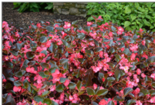
Megawatt Rose Bronze Leaf Begonia in bloom

Megawatt Rose Bronze Leaf Begonia is a fine choice for the garden, but it is also a good selection for planting in outdoor containers and hanging baskets. With its upright habit of growth, it is best suited for use as a 'thriller' in the 'spiller-thriller-filler' container combination; plant it near the center of the pot, surrounded by smaller plants and those that spill over the edges. It is even sizeable enough that it can be grown alone in a suitable container. Note that when growing plants in outdoor containers and baskets, they may require more frequent waterings than they would in the yard or garden.