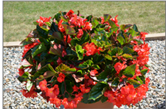
Megawatt Red Green Leaf Begonia in bloom

Megawatt Red Green Leaf Begonia is a fine choice for the garden, but it is also a good selection for planting in outdoor containers and hanging baskets. With its upright habit of growth, it is best suited for use as a 'thriller' in the 'spiller-thriller-filler' container combination; plant it near the center of the pot, surrounded by smaller plants and those that spill over the edges. It is even sizeable enough that it can be grown alone in a suitable container. Note that when growing plants in outdoor containers and baskets, they may require more frequent waterings than they would in the yard or garden.