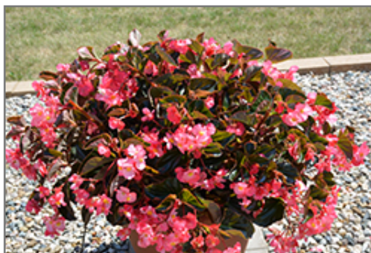
Megawatt Pink Bronze Leaf Begonia in bloom

Megawatt Pink Bronze Leaf Begonia is a fine choice for the garden, but it is also a good selection for planting in outdoor containers and hanging baskets. With its upright habit of growth, it is best suited for use as a 'thriller' in the 'spiller-thriller-filler' container combination; plant it near the center of the pot, surrounded by smaller plants and those that spill over the edges. It is even sizeable enough that it can be grown alone in a suitable container. Note that when growing plants in outdoor containers and baskets, they may require more frequent waterings than they would in the yard or garden.