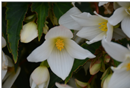
Beauvilia White Begonia flowers