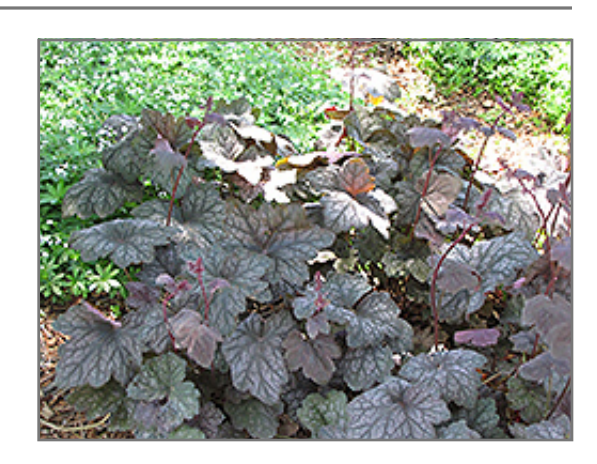
Velvet Night Coral Bells in bloom

This is a relatively low maintenance plant, and should be cut back in late fall in preparation for winter. It is a good choice for attracting hummingbirds to your yard. It has no significant negative characteristics.