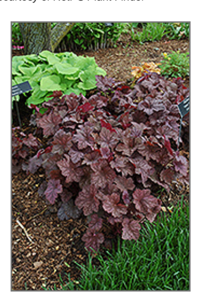
Velvet Night Coral Bells

Velvet Night Coral Bells is recommended for the following landscape applications;