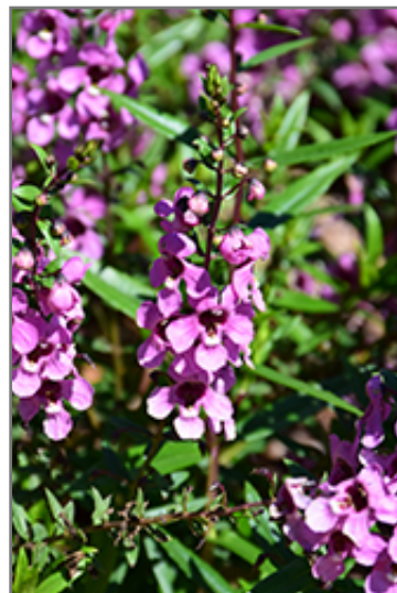
Sungelonia Pink Angelonia flowers

Sungelonia Pink Angelonia is recommended for the following landscape applications;