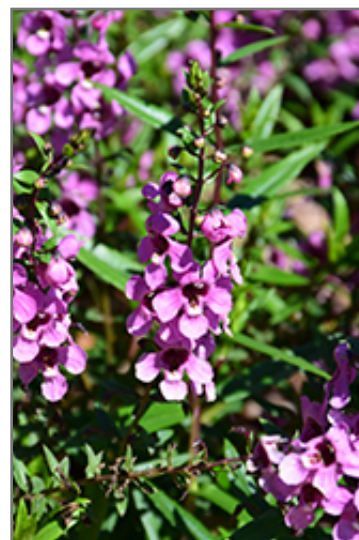
Sungelonia Pink Angelonia flowers

Sungelonia Pink Angelonia is recommended for the following landscape applications;