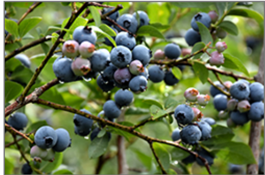
Rubel Blueberry fruit

Rubel Blueberry features dainty clusters of white bell-shaped flowers with shell pink overtones hanging below the branches in mid spring. It has green deciduous foliage. The glossy oval leaves turn red and orange in fall. It features an abundance of magnificent blue berries in mid summer. The smooth brick red bark and yellow branches add an interesting dimension to the landscape.