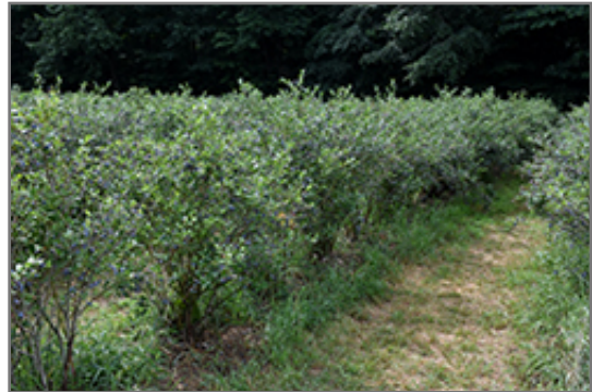
Rubel Blueberry fruit