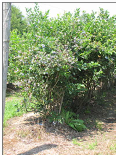
Rancocas Blueberry fruit