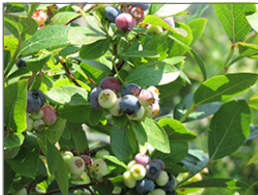
Rancocas Blueberry fruit

Rancocas Blueberry features dainty clusters of white bell-shaped flowers hanging below the branches in mid spring. It has green deciduous foliage. The glossy oval leaves turn yellow and red in fall. It features an abundance of magnificent blue berries in early summer. The smooth brick red bark adds an interesting dimension to the landscape.