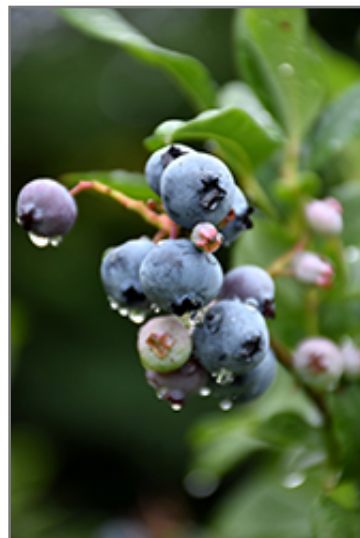
Bonus Blueberry fruit

Aside from its primary use as an edible, Bonus Blueberry is suitable for the following landscape applications;