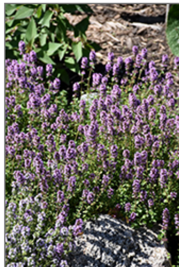
Oregano Thyme in bloom