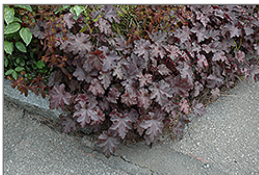
Stormy Seas Coral Bells

Stormy Seas Coral Bells is recommended for the following landscape applications;