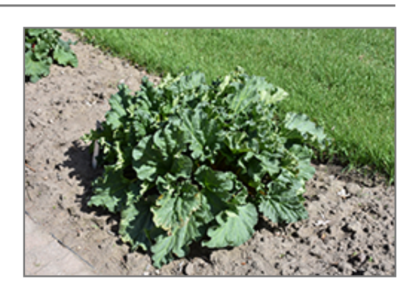
Glaskin's Perpetual Rhubarb

This is an herbaceous perennial with a rigidly upright and towering form. Its wonderfully bold, coarse texture can be very effective in a balanced garden composition. This plant will require occasional maintenance and upkeep, and can be pruned at anytime. Deer don't particularly care for this plant and will usually leave it alone in favor of tastier treats. It has no significant negative characteristics.