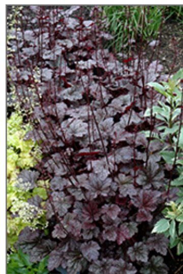
Plum Pudding Coral Bells in bloom