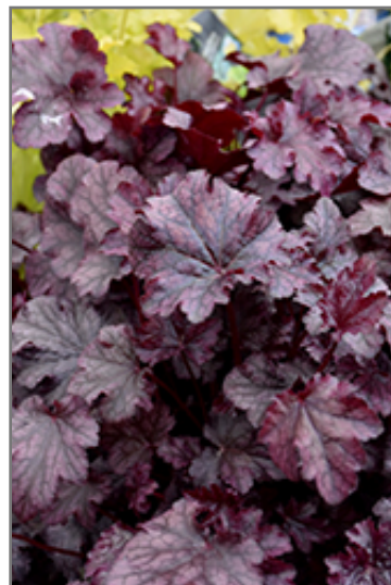
Plum Pudding Coral Bells foliage

Plum Pudding Coral Bells is recommended for the following landscape applications;