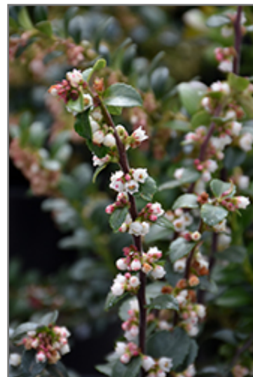
Thunderbird Evergreen Huckleberry flowers