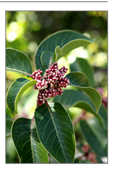
Sugar Bush flower buds