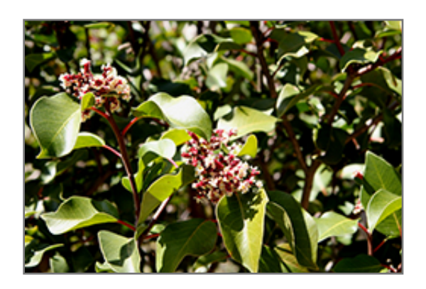
Sugar Bush flowers