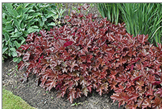
Chocolate Ruffles Coral Bells

Chocolate Ruffles Coral Bells is recommended for the following landscape applications;