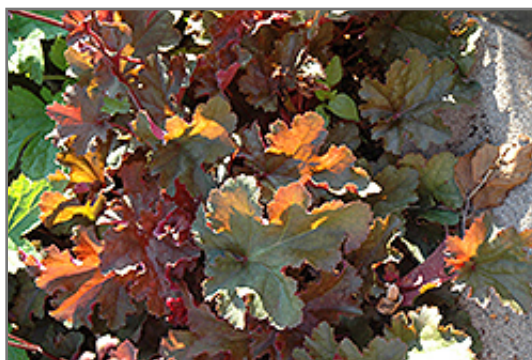
Chocolate Ruffles Coral Bells foliage

Chocolate Ruffles Coral Bells will grow to be about 10 inches tall at maturity extending to 24 inches tall with the flowers, with a spread of 12 inches. When grown in masses or used as a bedding plant, individual plants should be spaced approximately 10 inches apart. Its foliage tends to remain low and dense right to the ground. It grows at a medium rate, and under ideal conditions can be expected to live for approximately 10 years. As an evergreen perennial, this plant will typically keep its form and foliage year-round.