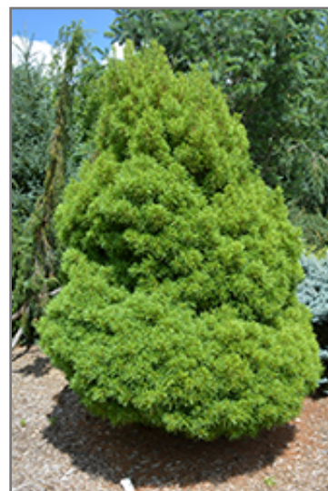
Tiny Kurls White Pine

Tiny Kurls White Pine is recommended for the following landscape applications;