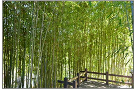
Golden Bamboo