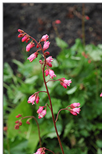
Brandon Pink Coral Bells flowers