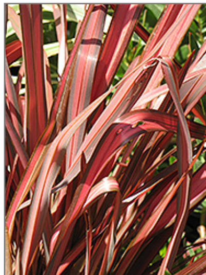
Rainbow Warrior New Zealand Flax foliage