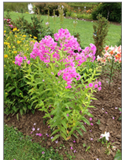
Peacock Rose Dark Eye Garden Phlox in bloom