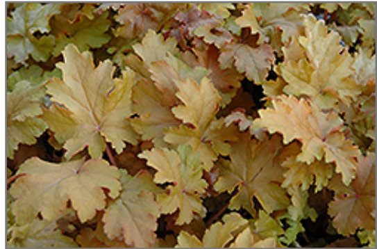
Amber Waves Coral Bells foliage

Amber Waves Coral Bells will grow to be only 6 inches tall at maturity extending to 12 inches tall with the flowers, with a spread of 12 inches. When grown in masses or used as a bedding plant, individual plants should be spaced approximately 10 inches apart. Its foliage tends to remain low and dense right to the ground. It grows at a medium rate, and under ideal conditions can be expected to live for approximately 10 years. As an evergreen perennial, this plant will typically keep its form and foliage year-round.