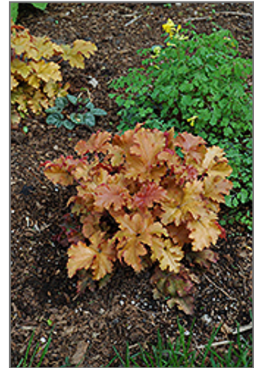
Amber Waves Coral Bells

Amber Waves Coral Bells is recommended for the following landscape applications;