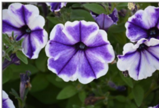
Crazytunia Blue Ice Petunia flowers