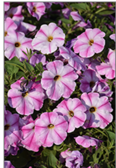
ColorRush Pink Star Petunia flowers