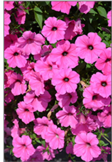
ColorRush Pink Petunia flowers