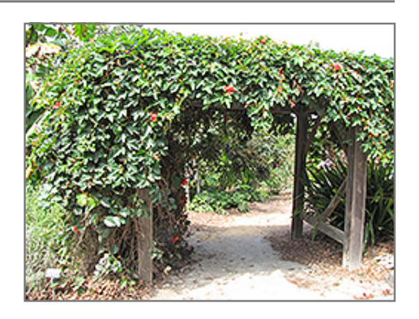
Crimson Passion Flower in bloom

Crimson Passion Flower will grow to be about 15 feet tall at maturity, with a spread of 30 inches. As a climbing vine, it should either be planted near a fence, trellis or other landscape structure where it can be trained to grow upwards on it, or allowed to trail off a retaining wall or slope. Although it's not a true annual, this fast-growing plant can be expected to behave as an annual in our climate if left outdoors over the winter, usually needing replacement the following year. As such, gardeners should take into consideration that it will perform differently than it would in its native habitat.