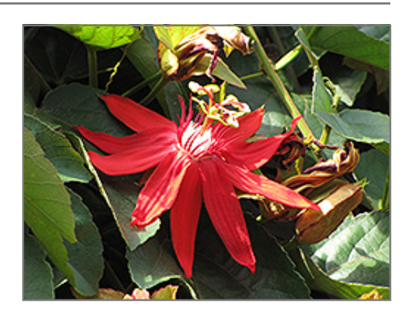
Crimson Passion Flower flowers

Crimson Passion Flower is recommended for the following landscape applications;