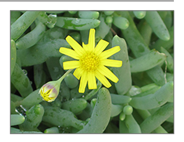
Little Pickles flowers

Little Pickles is recommended for the following landscape applications;