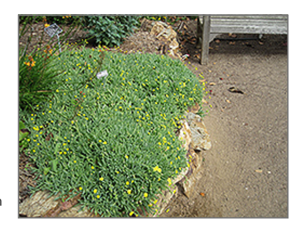
Little Pickles in bloom

Little Pickles will grow to be only 4 inches tall at maturity extending to 6 inches tall with the flowers, with a spread of 12 inches. Although it's not a true annual, this plant can be expected to behave as an annual in our climate if left outdoors over the winter, usually needing replacement the following year. As such, gardeners should take into consideration that it will perform differently than it would in its native habitat.