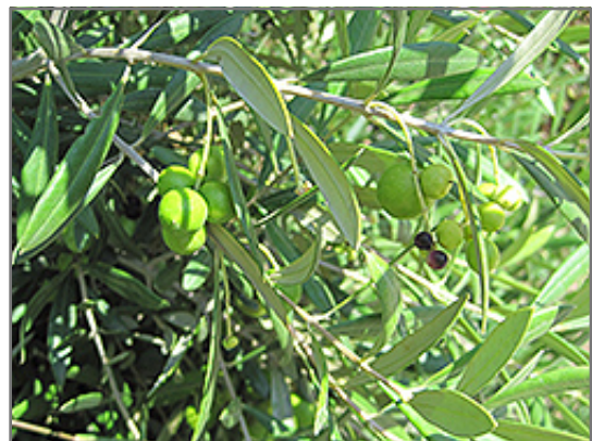
Little Ollie&reg Dwarf Olive fruit