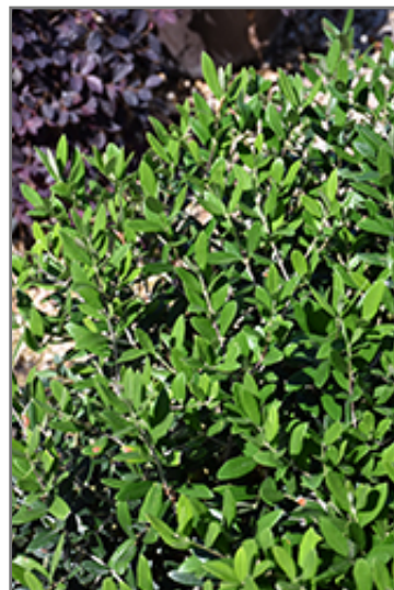
Little Ollie&reg Dwarf Olive foliage

This plant is not reliably hardy in our region, and certain restrictions may apply; contact the store for more information.