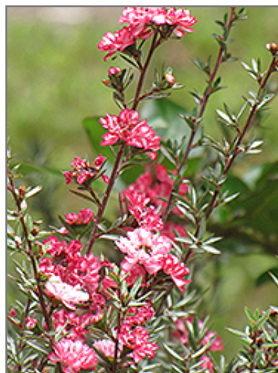
Broom Tea-Tree flowers