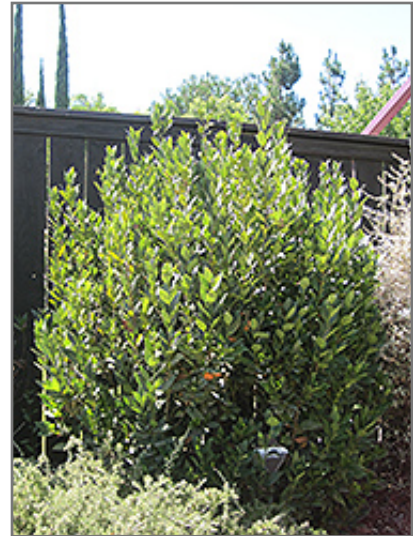
Sweet Bay (shrub form)