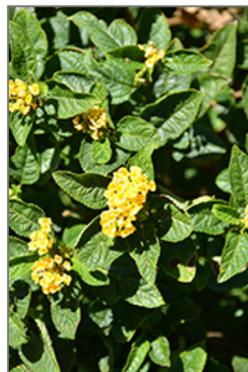
Dwarf Yellow Bush Lantana flowers