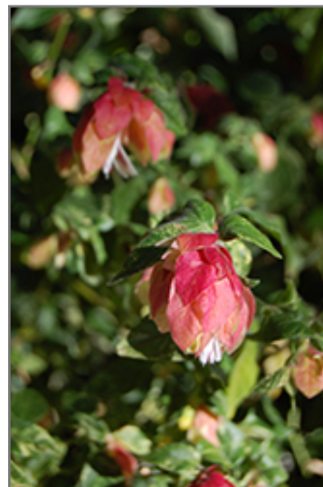
Variegated Shrimp Plant flowers

Variegated Shrimp Plant is recommended for the following landscape applications;