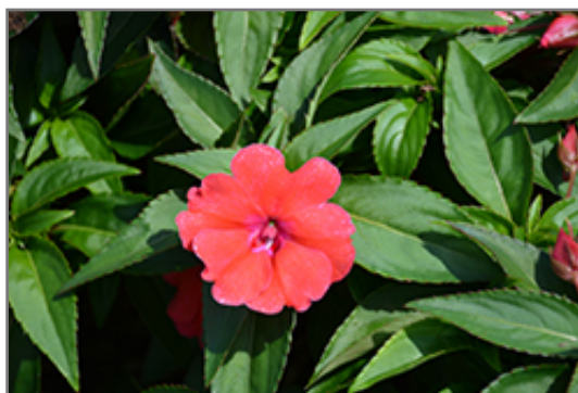
Bounce Bright Coral Impatiens flowers