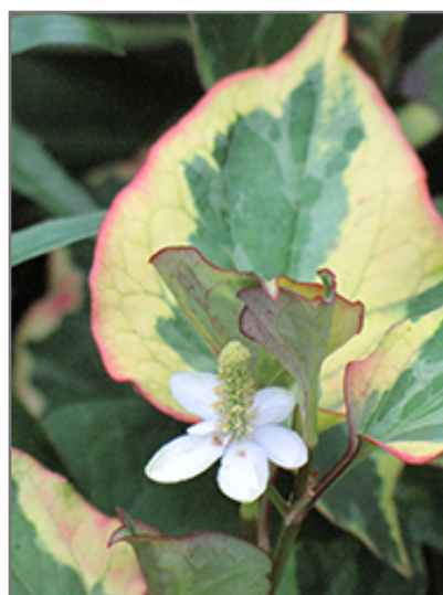
Chameleon Houttuynia flowers