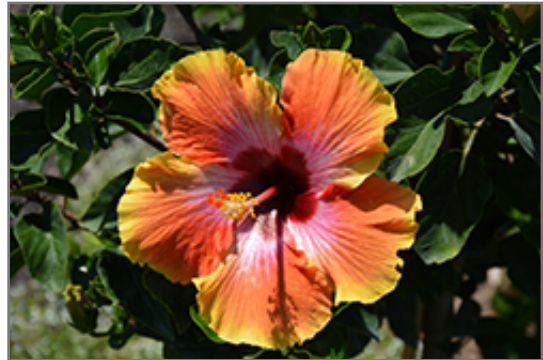
Fiesta Hibiscus flowers

This plant is native to the tropics and prefers growing in moist environments with evenly warm conditions all year round. In our climate, it is usually grown as an outdoor annual in the garden or in a container. If you want it to survive the winter, it can be brought in to the house and provided with special care, and then returned to the garden the following season. In its preferred tropical habitat, it can grow to be around 8 feet tall at maturity, with a spread of 6 feet. However, when grown as an annual or when overwintered indoors, it can be expected to perform differently, and its exact height and spread will depend on many factors; you may wish to consult with our experts as to how it might perform in your specific application and growing conditions.