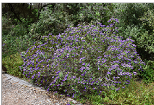
Blue Gem Hebe in bloom