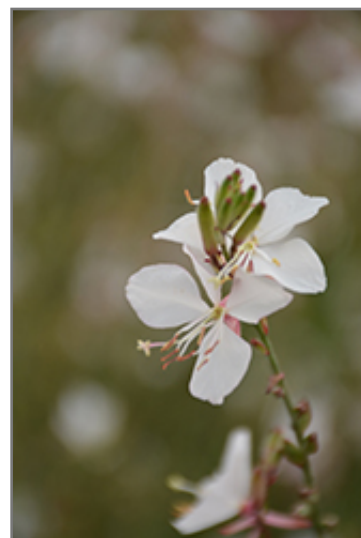
Geyser White Gaura flowers