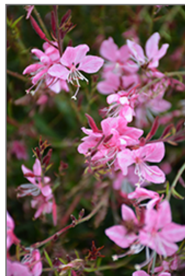
Gaudi Rose Gaura flowers

Gaudi Rose Gaura is recommended for the following landscape applications;