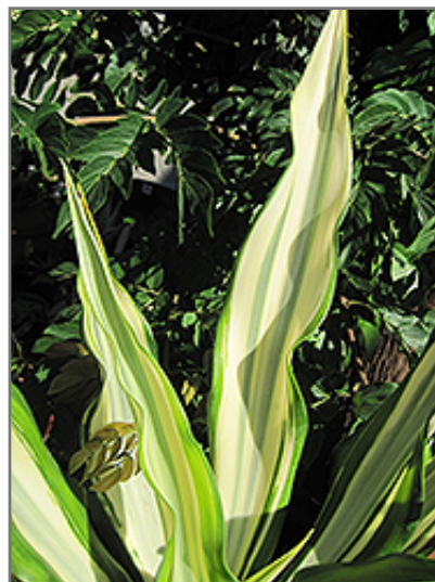
Variegated False Agave foliage