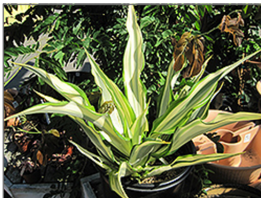
Variegated False Agave