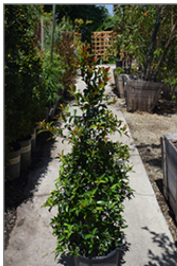
Monterey Bay Brush Cherry