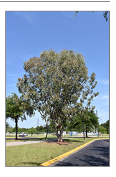
Mountain Gum