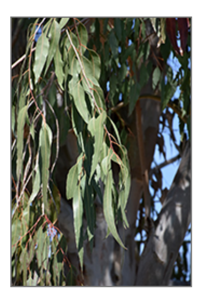
Mountain Gum foliage