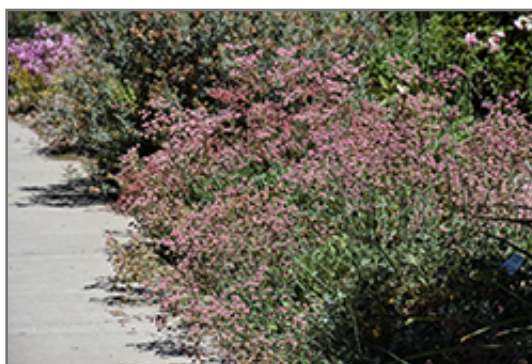
Red Buckwheat in bloom