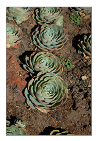
Blue Rose Echeveria