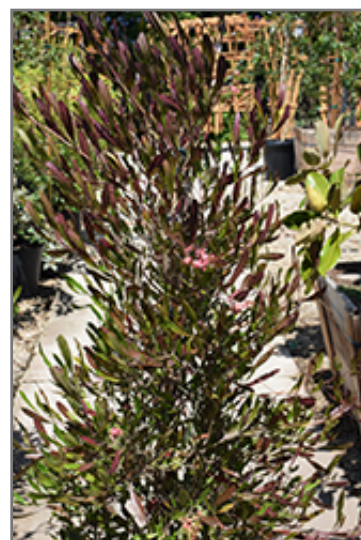
Purple Hop Bush