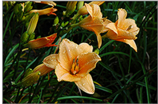
Sombrero Way Daylily flowers